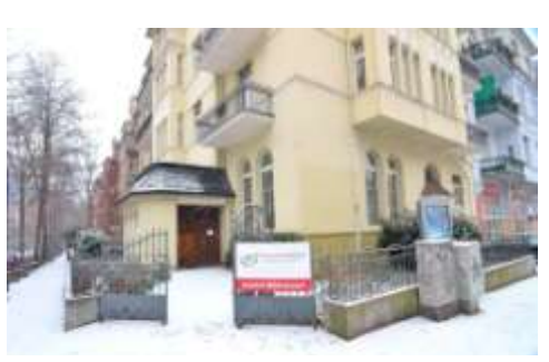
Entrance to Church with flat on top

At Calvary Chapel Wiesbaden we are growing! In Fall we took out the separating wall to open the meeting room up for more chairs. To accommodate the additional children we converted part of a kitchen into a class room – we now have three children's classes! In February we were given the opportunity to rent a 4-room apartment above the church.